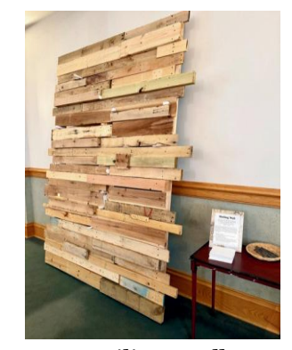
Wailing Wall This wall gives you the opportunity to privately express your heart to God.