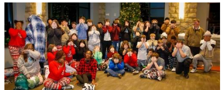
Christmas Party at Holston Homes

Thank you again for your love and support. We would be nothing without generosity like yours.