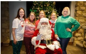
Santa Elves Inc. Board of Directors

SANTA ELVES INC is grateful for the incredible support of FPC in making Christmas a little brighter for the 70 kids and young adults we were able to help this year. On December 20, 2024, we hosted a party for the 60 kids in residence at Holston Homes for children. We had a catered dinner, took massive amounts of Polaroids, passed out small gifts (with PJ's, soft blankets, snacks, and hygiene products), and spent time enjoying each other's company to celebrate the upcoming holiday. On Christmas morning, the kids all opened their wish list boxes stuffed full of the items each child wished for. The kids and adults all had a great time at the party, and we hope that their Christmas experience showed them that their community sees and loves them. It is always our hope that any small thing we do will encourage the kids to dig in and complete their programs. In addition, your support also made it possible for us to provide wish list gifts for 10 at-risk kids living with relatives in the community.