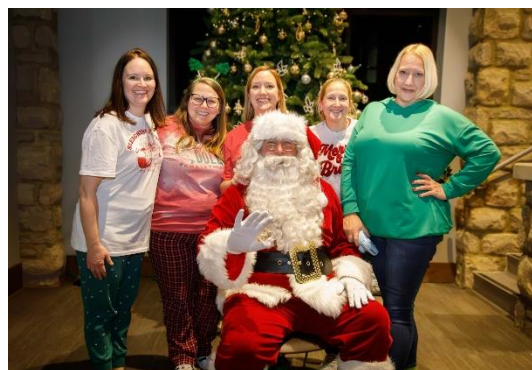
Santa Elves Inc. Board of Directors