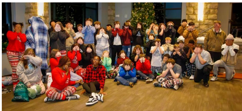
Christmas Party at Holston Homes

Thank you again for your love and support. We would be nothing without generosity like yours.